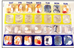
"Bubble pack" medications prepared by a pharmacist.