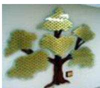
Perpetual Tree located at the High School

I would like to donate an auction item. Date it may be picked up _____.