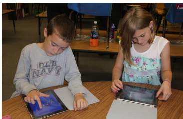
Students using iPads purchased through MSDF..