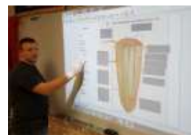
Mimio Boards at the High School