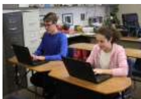
New computers for the High School Business Education classes