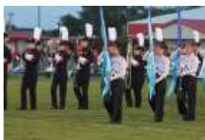
New Band Uniforms