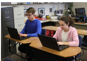
New computers for the High School Business Education classes