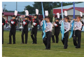
New Band Uniforms