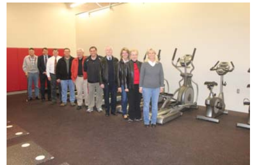
Weight room equipment at the High School